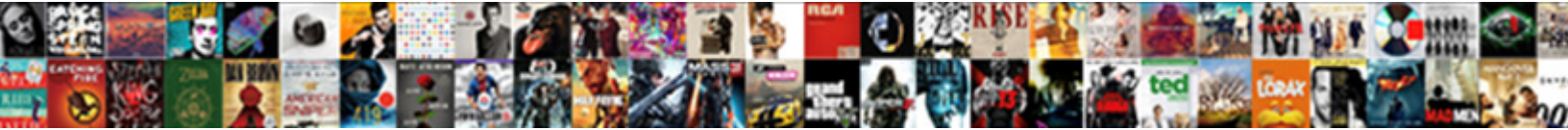
Table Lighters Collectors Guide